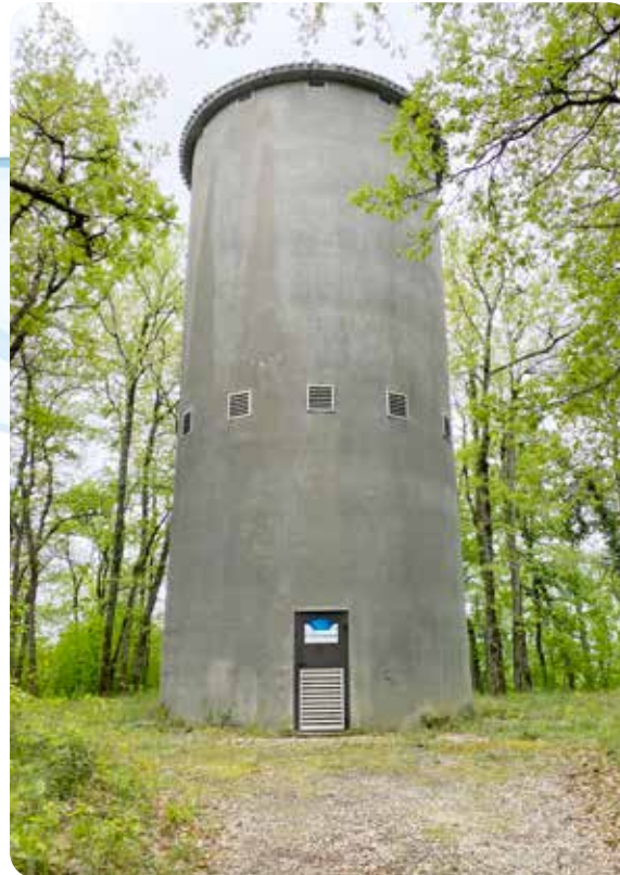
Caussade water tower